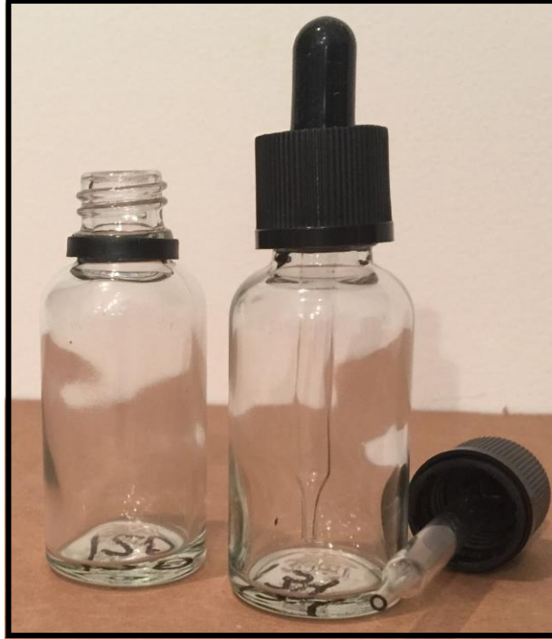
PHOTO: Glass Dropper Bottle